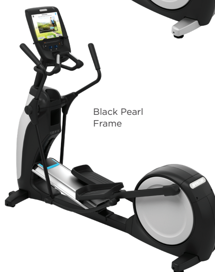
Black Pearl Frame

Refined colorways with dark Tungsten covers and two frame color options.